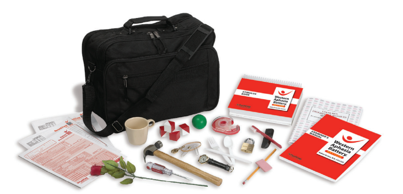
WAB–R Kit with Manipulatives and Raven's Colored Progressive Matrices™ (CPM) Sets A, AB, B